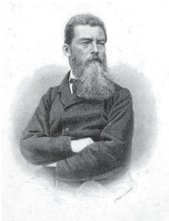
Ludwig Andreas Feuerbach

an ideological trend of anti-science and anti-technology. science and technology, once regarded as the driving force of human society, became an obstacle to its progress and was even deemed to be a devil debasing human nature. As Austrian philosopher Ludwig Wittgenstein once put, the era of science and technology is the beginning of the end of human nature; the concepts about great progress, along with the belief that truth can eventually be recognized, are nothing but misconceptions; in fact, there is no positive thing worth pursuing in the scientific world; those who search for knowledge shall fall into a trap. Wittgenstein's view on science and technology is of course wrong.