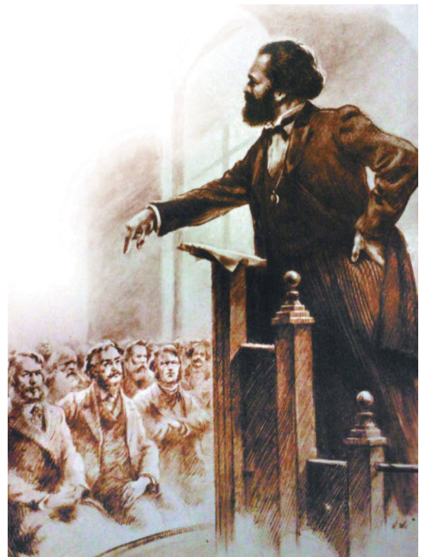
Karl Heinrich Marx

As has been proved by the development of capitalism, the growing material desire and pursuing endless consumption may force some real talents to